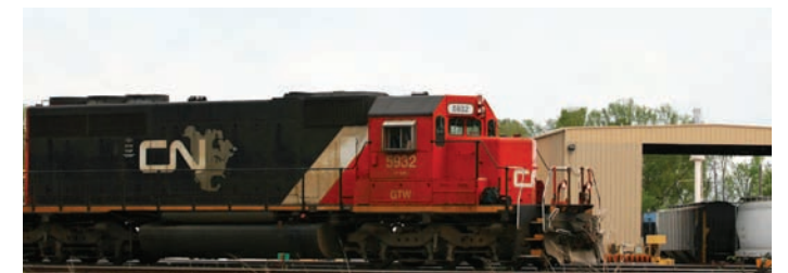
Class I rail provided by Canadian National / Illinois Central.