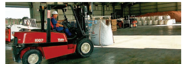
Supersacks loaded onto trucks at general cargo warehouse.