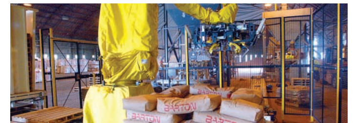
Robots bag garnet sand at one of POSL's warehouses.