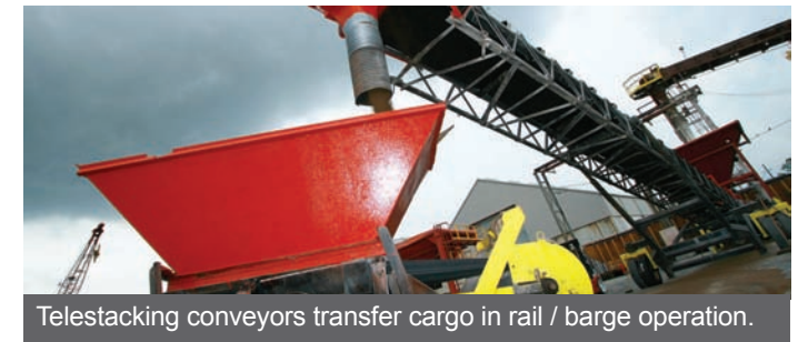
Telestacking conveyors transfer cargo in rail / barge operation.