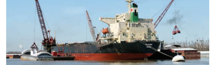
Four midstream berths, all with barge fleetings located nearby.