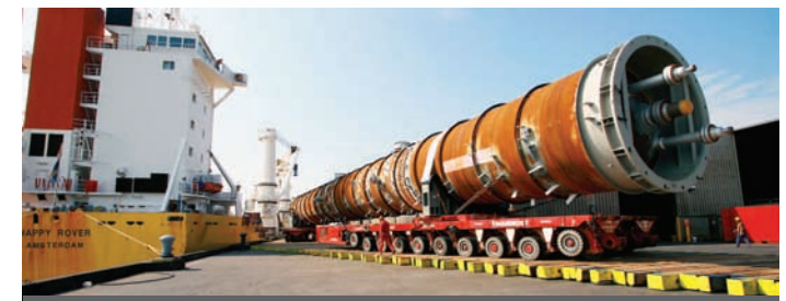
Project cargo is a frequent sight at the Chalmette Slip.